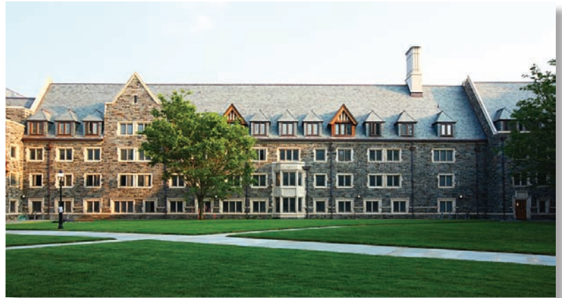
PROJECT: WHITMAN COLLEGE, PRINCETON, NJ

Princeton University's Whitman College, a massive new-construction residence hall which opened in the fall of 2007, was one of the largest, most technically demanding copper and slate roofing jobs ever undertaken by Bregenzer Brothers, Inc. Over 15 months they custom built and installed the 110,000 square foot slate and copper roof ranging over multiple buildings surrounding two large outdoor quadrangles. The job required 467 tons of slate and 30 tons of copper, and included exterior work over 104 dormers, flashings, a full network of drainage pipes and leader heads, plus other custom building details, large and small, from custom-fabricated chimney caps to handmade brass exterior finishing nuts. The aura of elegance of the completed college is in no small part due to the craftsmanship of the roof and details created by Bregenzer Brothers.