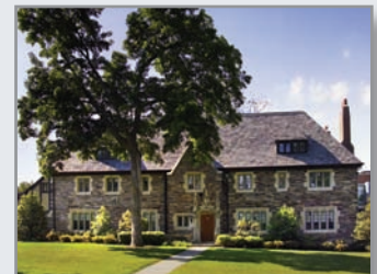
Dial Lodge, Prospect Street, Princeton