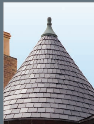
Cone Slate Roof - Dodd Hall, Princeton University

The Whitman College, Princeton University Witherspoon Hall, Princeton University Humanities Building, Princeton University Jones, Clio & Blair Hall, Princeton University Princeton University Press Princeton Theological Society, Miller Chapel St. Paul's Church, Princeton 185 Nassau Street, Princeton Dial Lodge, Prospect St., Princeton Town Topics Building, Princeton